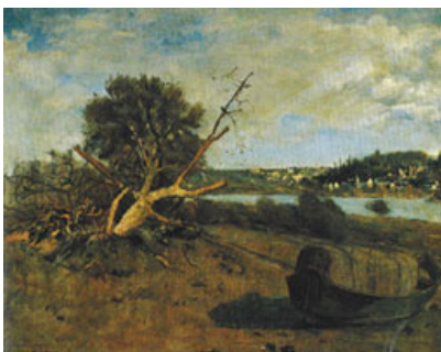
Fig. 6 Charles-François Daubigny Flood at Billancourt , ca. 1866 Private Collection