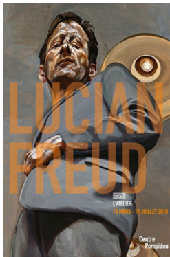
Fig. 1 Lucian Freud. L'Atelier Centre Pompidou 10 March to 19 July 2010, Paris