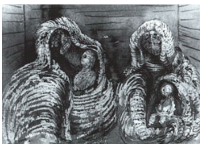
Figs. 8 and 9 Henry Moore Shelter Scene: Clothed Figures with Children , 1941 Private collection, USA