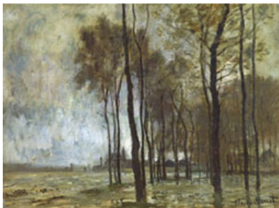
Fig. 7 Claude Monet Flood at Argenteuil, 1872 Bridgestone Museum of Art, Ishibashi Foundation, Tokyo