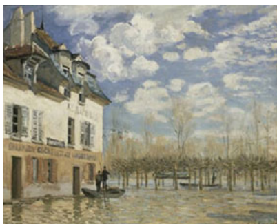
Fig. 9 Alfred Sisley The Boat during the Flood, Port-Marly, 1876 Musée d'Orsay, Paris

and aestheticism, the critic Ernest Lacan would eloquently declare: "They are very sad pictures, but beautiful too in their sadness!" 4