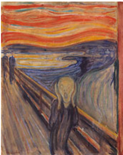
Fig. 8 Edvard Munch The Scream , 1893 Nasjonalmuseet for kunst, arkitektur og design, Oslo

His repeated use of the same concepts has made it difficult to identify some works due to the lack of precise descriptions. Evening , for example, may refer to various works of 1888, 1889 (fig. 3) and 1891 (fig. 7). The association with melancholy is established through the particular time of day depicted in the painting and by Laura's expression. Even more significant, however, is the clear link between this painting and subsequent works that constitute the corpus of Munch's images based on this particular emotion. Melancholy (1891) (fig. 7) was initially entitled Evening (as well as Jealousy and The yellow Boat ) and its composition is a refinement of the present painting, albeit turned the opposite way. The isolation of the foreground figure, this time located in the right-hand corner, the undulating coastline and the background scene repeat the composition of Evening .