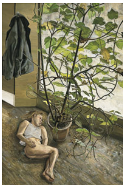
Fig. 2 Lucian Freud Large interior. Paddington , 1968-1969 Museo Thyssen-Bornemisza, Madrid [+ info]