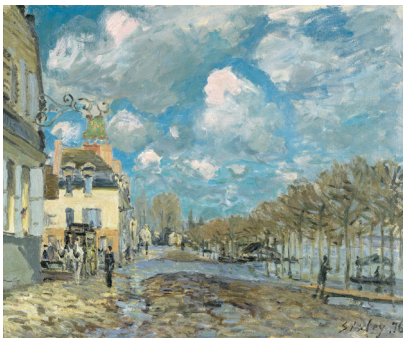
Fig. 1 Alfred Sisley Flood at Port-Marly , 1876 Carmen Thyssen-Bornemisza Collection on loan at the Museo Thyssen-Bornemisza, Madrid [+ info]

In March 1876 the River Seine burst its banks at the harbour of Port-Marly, situated at the foot of Marly-le-Roi. Alfred Sisley (1839-1899), who had taken up residence in the town at the end of 1874, took the opportunity to paint a series of works on the flood. Now regarded as crowning achievements in the English artist's career and a milestone in the evolution of Impressionism, they reveal an extraordinary harmony and luminosity. One of the works (fig. 1), owned by the Carmen Thyssen-Bornemisza Collection, offers us a chance to make a detailed study of Sisley's contribution.