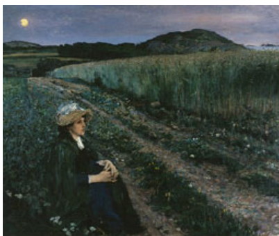
Fig. 4 Eilif Peterssen Evening at Sandø , 1884-1894 Private collection