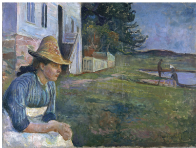
Fig. 1 Edvard Munch Evening , 1888 Museo Thyssen-Bornemisza, Madrid [+ info]

“A girl with a large, purple face under a yellow straw hat sitting on a blue lawn in front of a white house. The whole thing is so indescribably bad in every respect that it is almost comical.” 1