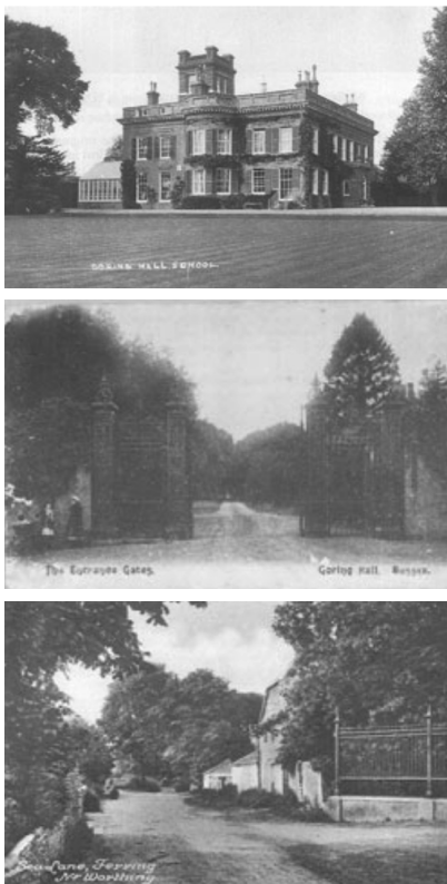
Fig. 3 Old postcard of Goring Hall converted into a school and lacking one of the towers