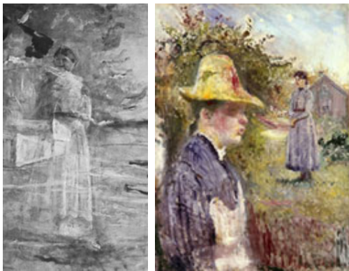
Fig. 5 Detail of the centre of Evening (fig. 1) using infra-red photography