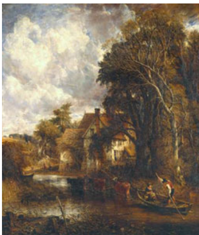
Fig. 11 John Constable The Valley Farm, 1835 Tate

Critics of Sisley’s oeuvre have always pointed out the importance of his cloudscapes. It could well have been the clouds in the picture in the Carmen Thyssen-Bornemisza Collection that the critic Georges Rivière was referring to when, in connection with Sisley’s contribution to the third Impressionist exhibition in 1877, he noted: “His wonderful landscape – a path after the rain, tall trees dripping with water, the wet ground, puddles of water mirroring the sky – is full of a charming lyricism.” 10