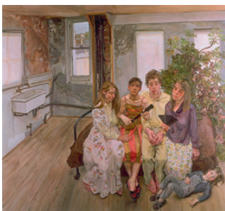
Fig. 6 Lucian Freud Large Interior W11 (after Watteau) , 1981-1983 Private collection

viewer experiences and making us feel more naked in their presence than we would ideally like.