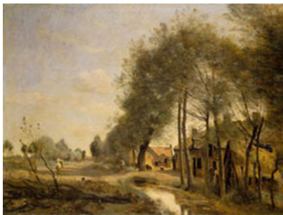
Fig. 10 Jean-Baptiste-Camille Corot The Sin-le-Noble Road, near Douai, 1873 Musée du Louvre, Paris

(1796-1875) (fig. 10). In the picture Flood at Port-Marly belonging to the Carmen Thyssen-Bornemisza Collection (fig. 1), the viewpoint chosen by the artist emphasises the linear perspective.