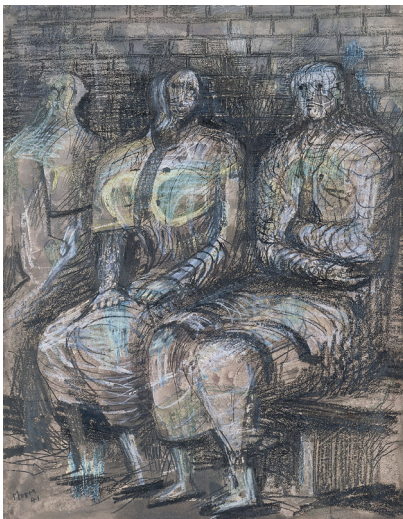
Fig. 1 Henry Moore Two Mothers Holding Children , 1941 Museo Thyssen-Bornemisza, Madrid