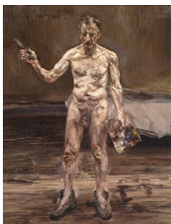
Fig. 3 Lucian Freud The Painter working . Reflection , 1993 Private collection

A giant-size blow-up of Reflection with two Children , mounted on the façade of the Centre Pompidou in Paris, welcomes visitors to the exhibition Lucian Freud. L'Atelier , curated by Cécile Debray (fig. 1). The incisive gaze of this great painter, made even more penetrating by the exaggerated use of a low angle in the composition, seems to alert us to the fact that in order to enter into his personal universe we must mentally prepare ourselves to survive his ability to disturb the viewer.