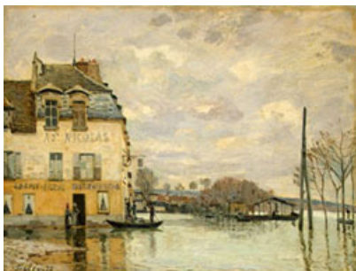
Fig. 8 Alfred Sisley Flood at Port-Marly, 1872 National Gallery of Art, Washington D.C.