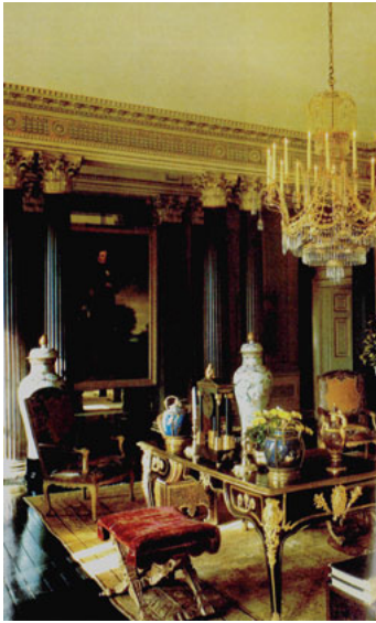
Fig. 8 The drawing-room at Daylesford, at that time the UK residence of Baron and Baroness Thyssen-Bornemisza