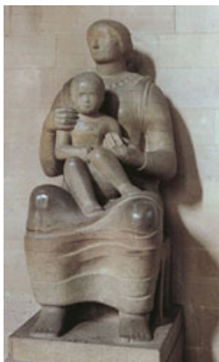
Fig. 6 Henry Moore Madonna and Child , 1943-1944 Church of St. Matthew, Northampton

Moore was initially reluctant to participate in the WAAC project as proposed by Clark, but his experience that night on the underground at the outset of the Blitzkrieg (lightning war) made him change his mind and he decided to produce drawings as a war artist.