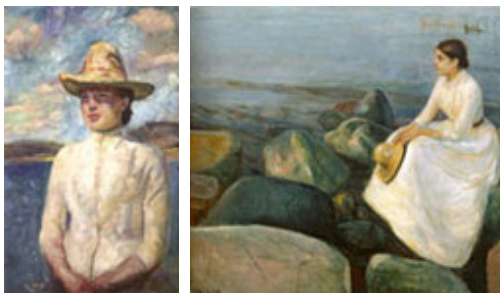
Fig. 2 Edvard Munch Inger in the Sun , 1888 Bergen Kunstmuseum (Rasmus Meyers Samlinger), Bergen