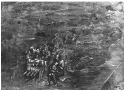
Fig. 7 Henry Moore Women and Children on the Underground , 1940 Imperial War Museum, London

The Mediterranean tradition, which Moore understood as a shared vision of the world that ran from archaic cultures to the Renaissance of Giotto and Masaccio, is present in these works in the monumentality and heroic solemnity of the figures and in the lack of interest in individualising them. Equally unimportant for Moore was the exact location of the scenes, which thus acquire a timeless air that is emphasised by the folds of the blankets that cover the figures in the manner of classical draperies.