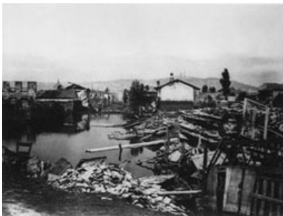
Fig. 5 Édouard Baldus Flood at Lyon, Les Brotteaux , 1856 Musée d’Orsay, Paris

The photographer Édouard Baldus (1813-1889) arrived in Lyon four days after Napoleon with the mission of creating a series of negatives on the effects of the flood. 3 At the time, Baldus was working on an official assignment to photograph the New Louvre and had previously produced vistas of Roman and medieval monuments in the south of France. When he reached Lyon, Avignon and Tarascon, the rivers were already returning to their usual levels. Over the course of eight days he produced 25 negatives, but rather than capturing the terrible consequences of the flood, he focused his attention on the semi-dilapidated buildings and the large pools of receding water (fig. 5). In contrast to the paintings by Bouguereau and Lazerges, his photographs eschew a direct confrontation with the tragedy, and yet they cannot avoid a certain cosmic symbolism, as if the water itself had erased all trace of human presence. Fascinated by this combination of reportage