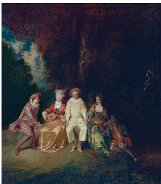
Fig. 5 Jean Antoine Watteau Pierrot Content , ca. 1712 Museo Thyssen-Bornemisza, Madrid [+ info]