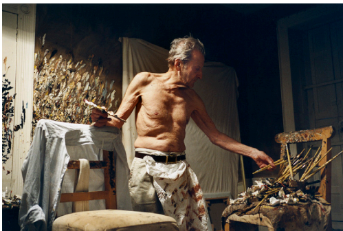
Fig. 7 Lucian Freud in his Studio