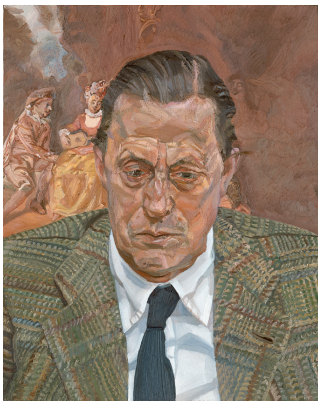
Fig. 4 Lucian Freud Portrait of Baron Thyssen-Bornemisza , 1981-1982 Museo Thyssen-Bornemisza, Madrid [+ info]