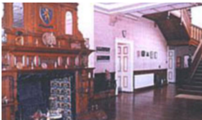
Figs. 6 and 7 Present-day view of Goring Hall, and the interior of the house with the coat-of-arms of the Lyon family over the fireplace

lived between Goring Hall and his London residence at 31 South Street, Grosvenor Square.