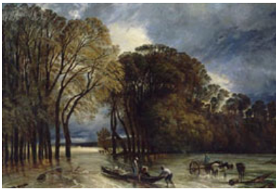
Fig. 4 Paul Huet Flood at Saint-Cloud , 1855 Musée du Louvre, Paris

On the subject of storms and the floods that often arise from them, Valenciennes urged young artists to “study the sublime scenes of a spectacle that cannot be admired without a shudder,” not hesitating to paint before their eyes scenes such as the following: “Large heavy drops announce the rain, which suddenly becomes a downpour; the condensed clouds, now grown too heavy for the air that supports them, plunge down almost en masse; torrents form, which grow and overflow, sweeping away earth, rocks, trees, animals and anything else that the rapid, muddy waters find in their path”. 2