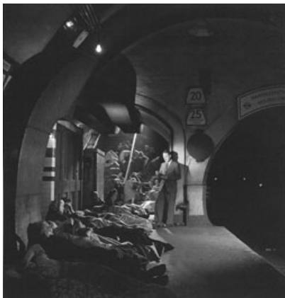
Fig. 4 Henry Moore making sketches in Holborn underground station, 1943 From the documentary by Jill Graigie Out of Chaos